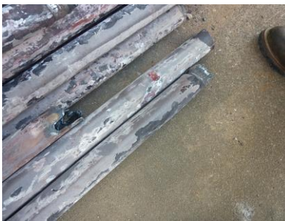
Boiler Tubes (before)