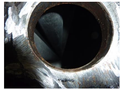
View inside the water drum (after)

The Challenge: Bush Beans were experiencing significant scale accumulation on their fire tube steam boiler despite the use of scale inhibiting chemicals. Bush Beans adhere to a strict blow down schedule as part of their planned maintenance program.